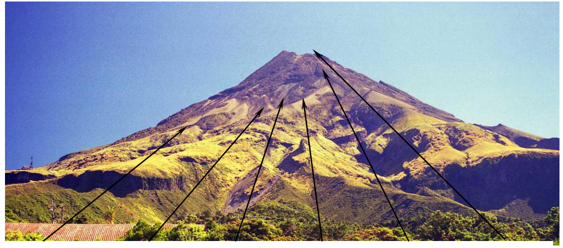
Tahurangi HutSnow ValleyHongi's BluffNorth RidgeThe LizardThe Summit

Note: Hongi's Bluff is located near the head of Snow Valley and is obscured by the North Ridge. The party descended from the summit and while crossing the head of Snow Valley, slipped on the icy slope above Hongi's Bluff and slid into the valley, two sliding 400 feet towards the Tahurangi Hut.